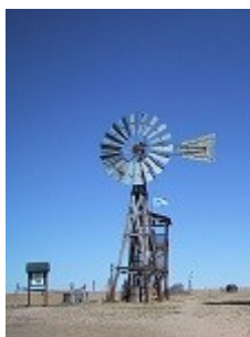
HAWT pumping water on a

Wind turbines can be classified as Horizontal axis or vertical axis, depending on how they turn. Horizontal axis wind turbines (HAWTs), like the ones pictured in Figure 1, consist of a rotor and a horizontal main rotor at the top of a tower. They also typically have a gearbox, which turns a slower rotation into a faster one, and a generator which produces electricity. You can find out more about how wind turbines work by reading Parts of a Wind Turbine .