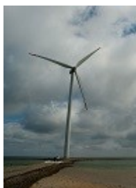
HAWT for electricity generation

The optimal number of rotating blades varies on horizontal-axis wind turbines. The multi-bladed, water-pumping windmills often seen on farms are designed differently than those designed for generating electricity. Water-pumping windmills tend to have a large number of blades while electricity-generating turbines usually have no more than three blades on their rotors.